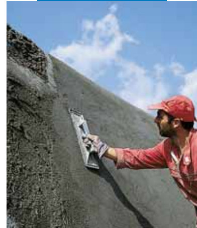
Finishing of Mapegrout T40