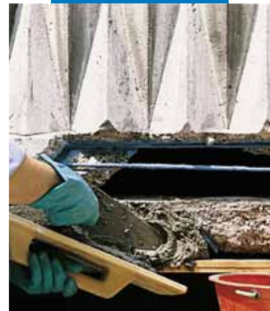
Repairing a balcony with Mapegrout T40