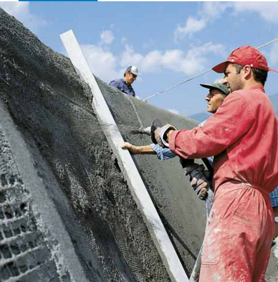
Spray application of Mapegrout T40