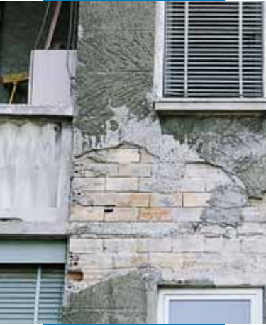
Degraded building façade in need of repair

abrasion: use Mapegrout Thixotropic or Mapegrout T60 instead.